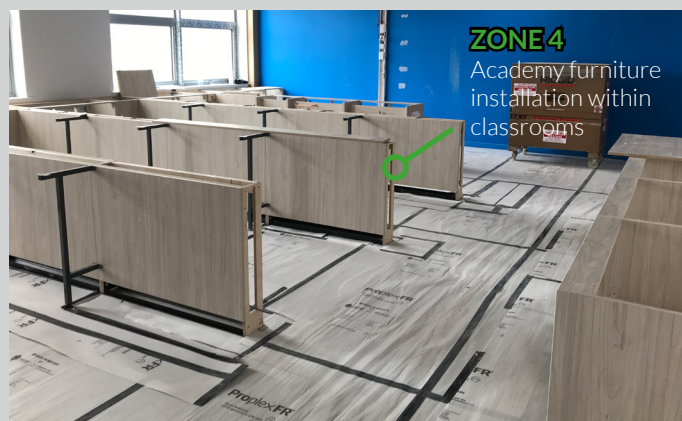
ZONE 4 Academy furniture installation within classrooms

Final external cladding and window works will finalise to the leisure centre ahead of progressing internal finishes, including tiling within the changing and pool areas. The pool finish will complete over the next two months which will be a significant milestone for this area.