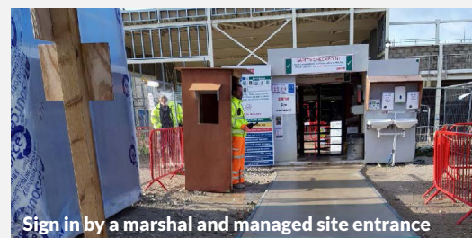
Enhanced hand washing facilities