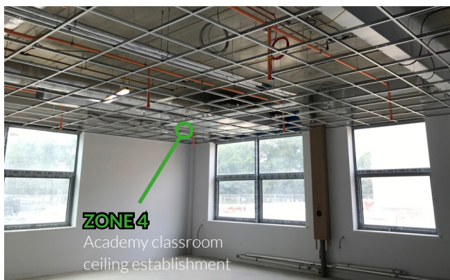
ZONE 4 Academy classroom ceiling establishment

Mechanical and Electrical works are progressing well, with the impressive plant room (the building's engine) taking shape. Many of the internal areas are also now having screed poured to establish the floors, prior to the final finish. Ceilings are also being established within the Academy and radiators installed throughout.