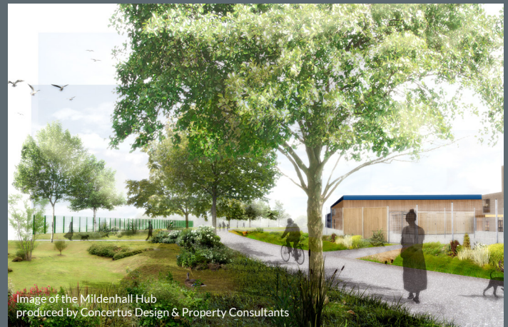
Image of the Mildenhall Hub produced by Concertus Design & Property Consultants

The multi-million pound project will create modern accessible services to people living in and around the town, and from the surrounding area, and includes a new school, children's centre, new leisure facilities, a health centre, facilities for Suffolk Police, West Suffolk Council and Suffolk County Council, as well as a library, job centre and Citizen's Advice centre.