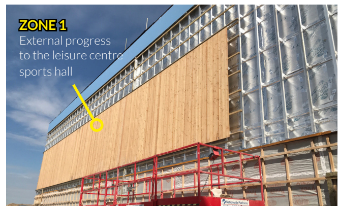
ZONE 1 External progress to the leisure centre sports hall