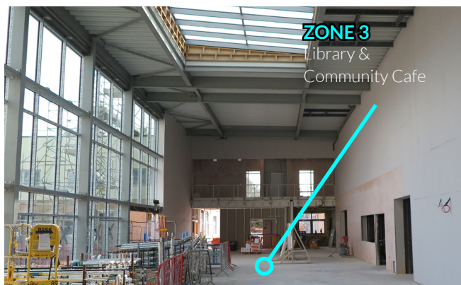
ZONE 3 Library & Community Cafe